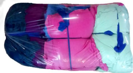
Figure 3: 15 kg finished bag