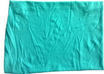
Figure 1: 1 - layer colored cloth