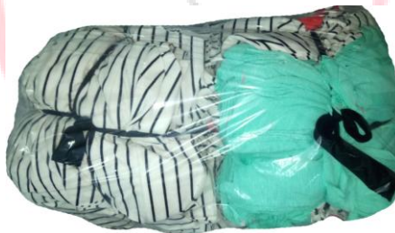
Figure 2: 10kg finished bag