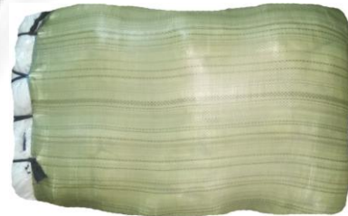
Figure 4: Package of finished products