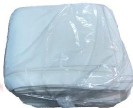
Figure 3: Finished bags