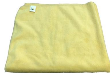
Figure 1: Towel