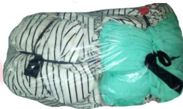
Figure 2: 10kg finished bag