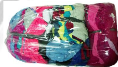
Figure 2: 15 kg finished bag